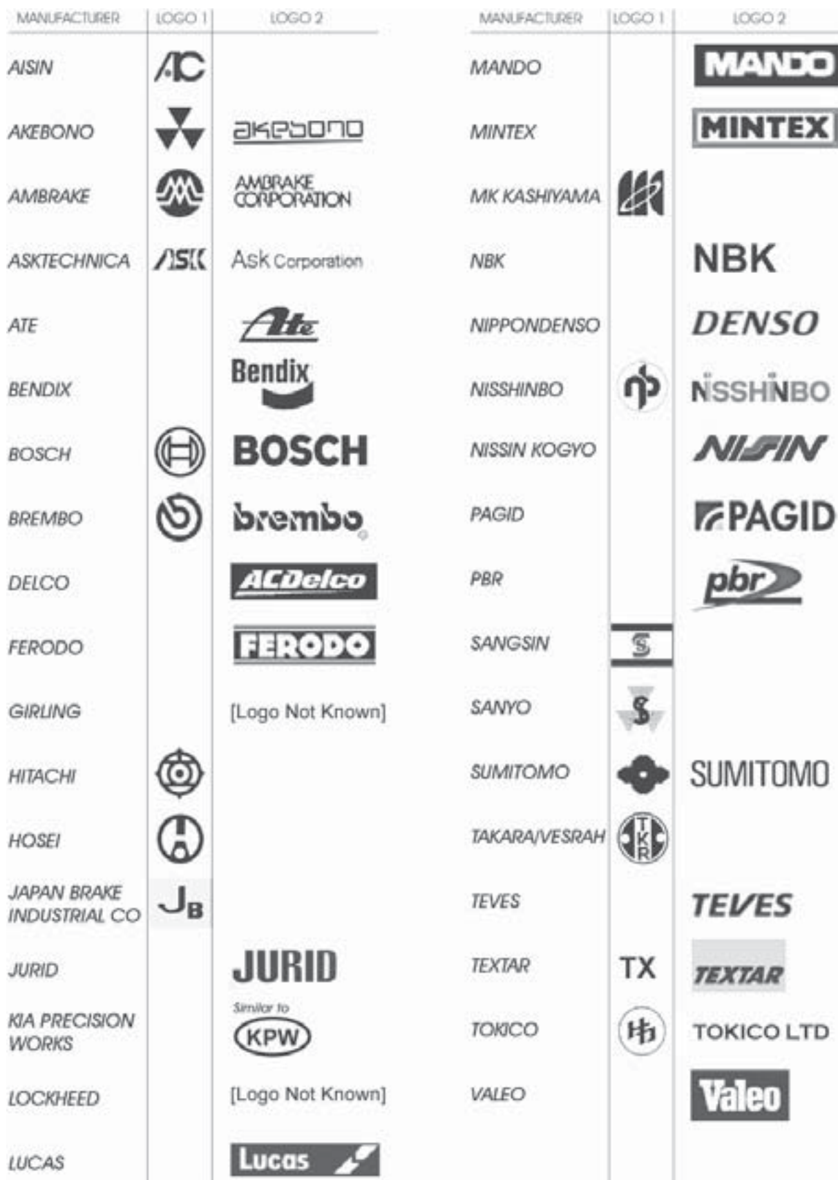
Table 8-2-2. Recognised brake friction material manufacturers