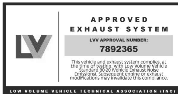
Figure 11-1-2. Objective noise test label