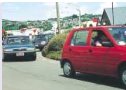
Approaching vehicles are hidden by vegetation