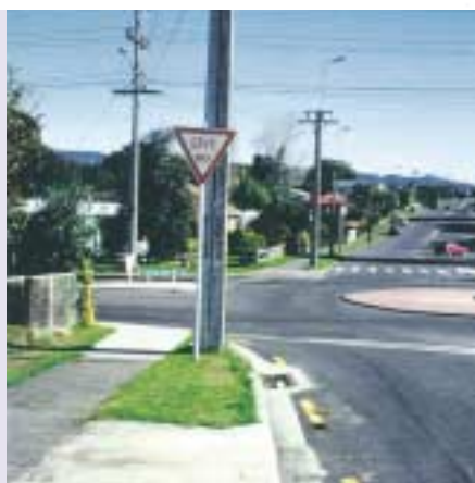
Poor location of solid concrete lamp-post on approach