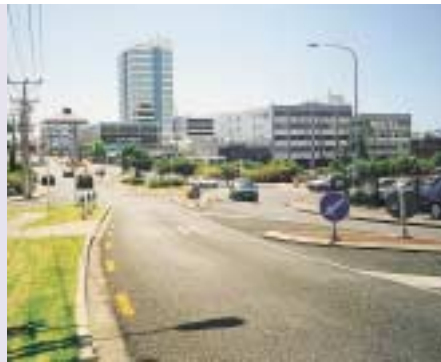
Badly aligned median with sharp transition. Roadmarking needs to be altered