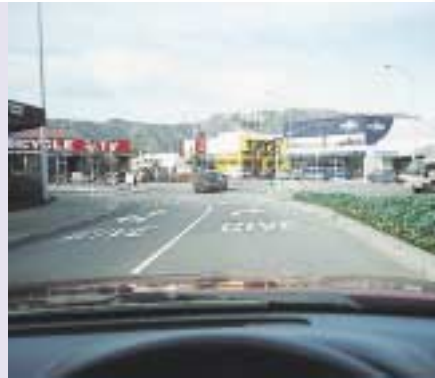
Poor central island design leading to a lack of island recognition