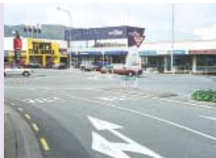
Good clear roadmarkings provide motorists with clear instructions