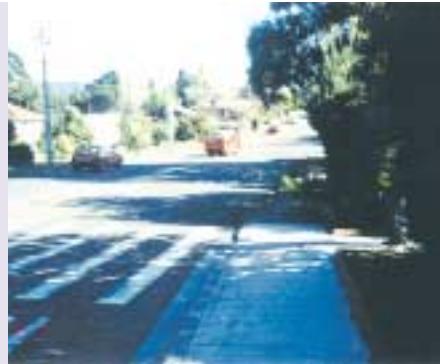
Shadow across crossing and vegetation hiding pedestrian