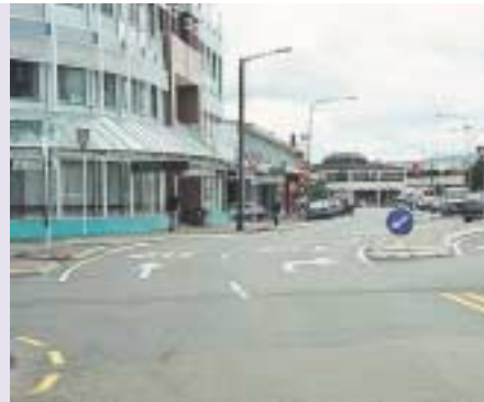
No deflection for straight through traffic