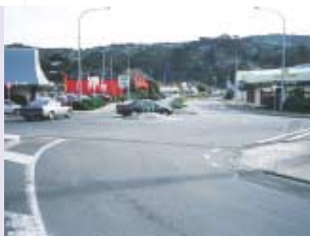
Street lighting poles located well clear of kerbs