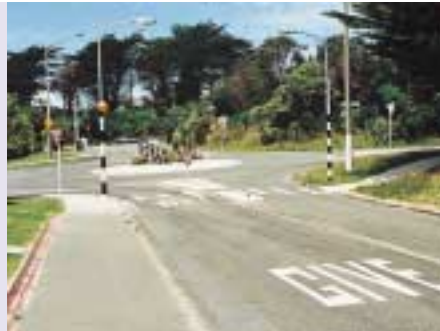
Good pedestrian design with linking paths and clear visibility