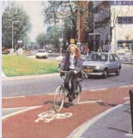
Typical cycle treatments used overseas