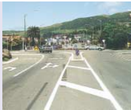
Good clear roadmarkings