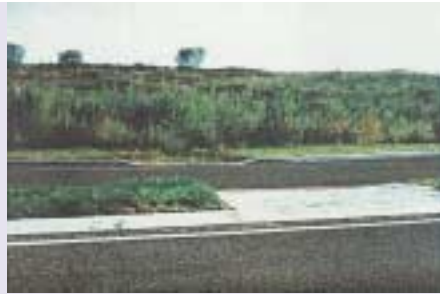
Pedestrian ramps leading nowhere