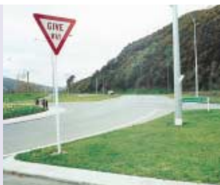
Excellent visibility provided for motorists