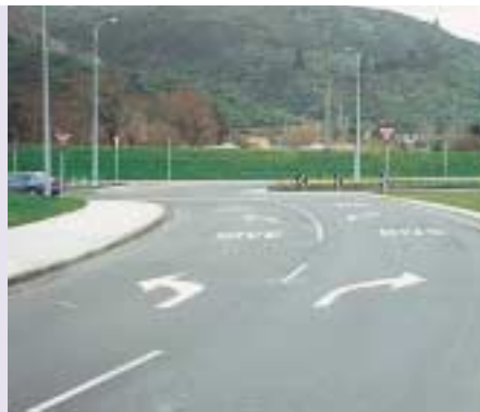
Good deflection of median further highlighted by roadmarking