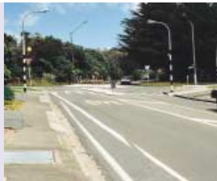
Good clear sight lines with pedestrian and motorist