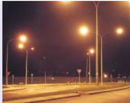
Street lighting highlighting roundabout and its approaches