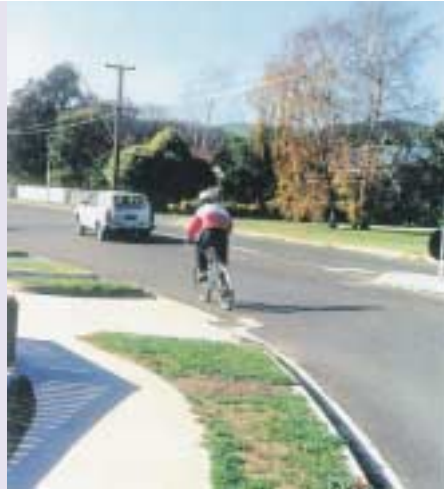
End of spitter island is beyond sump forcing rider to the left and onto stormwater grate