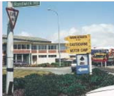
Destination signs hide approaching vehicles