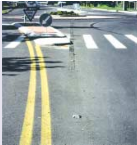
Old markings confuse pedestrians and motorists. Redundant reflective markers misguide motorists