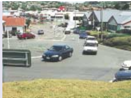
Multi-lane roundabout providing no guidance to motorists in the circulating roadway