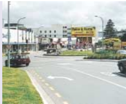
Raised central island improves the intersection control and its recognition