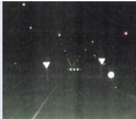
Streetlights lead motorists straight through the roundabout