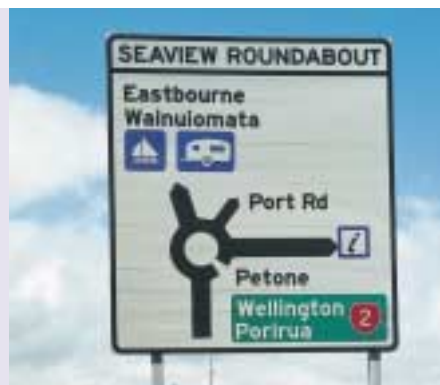
Good clear directions given to motorists in advance of the roundabout