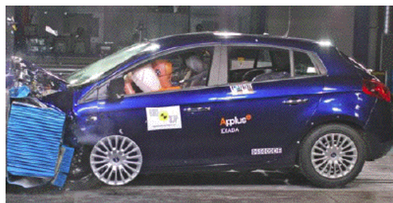
Offset crash test at 64km/h (front hubcap dislodged)

FIAT BRAVO/RITMO with ESC (LHD) 2008 on Front+side+head airbags